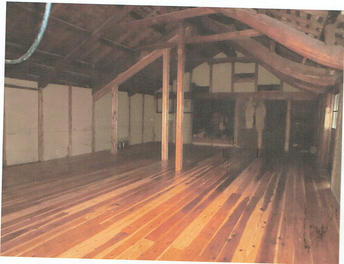
・ Finish to varnish the floor. ニスぬりが終わりました。