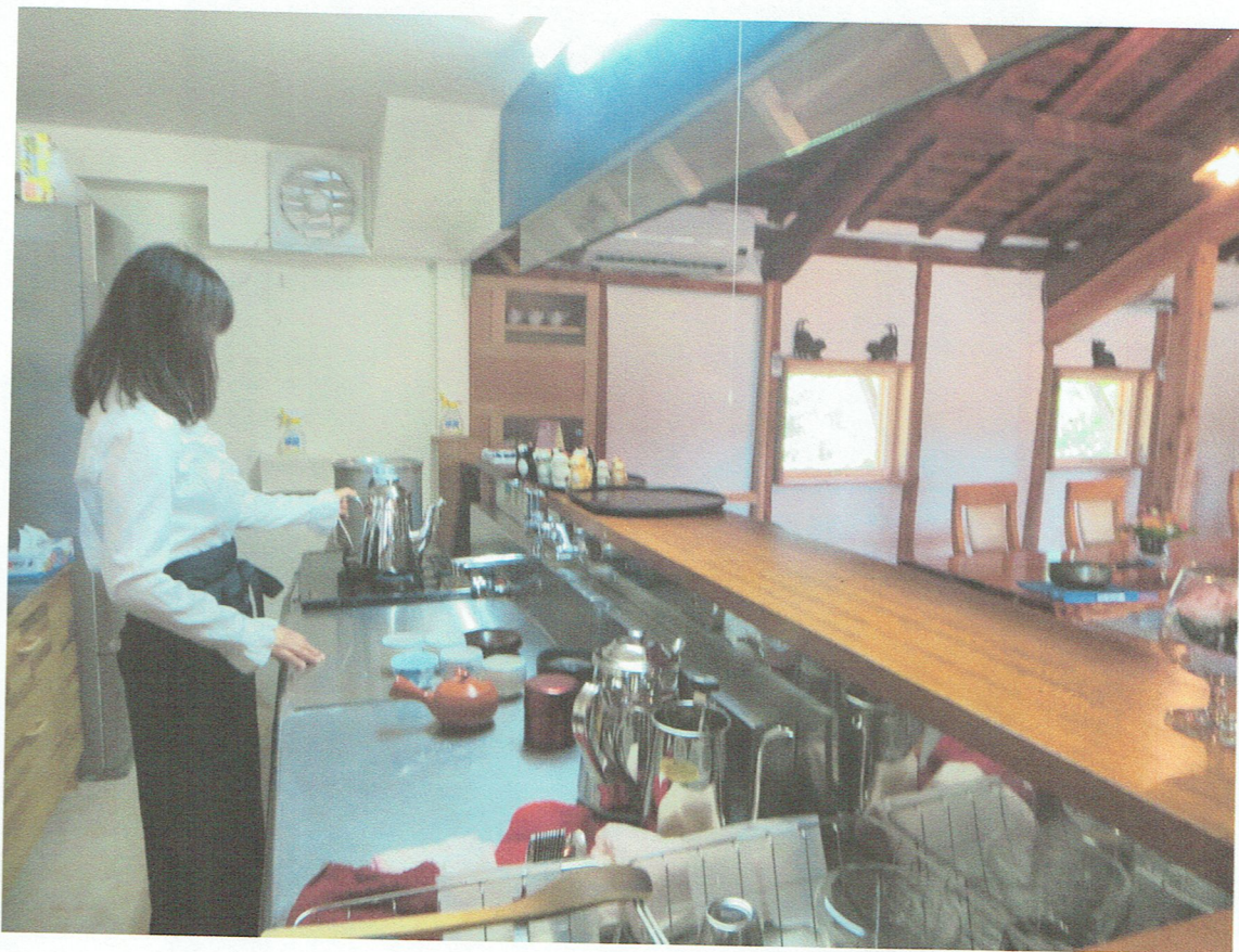
• This is inside of counter.