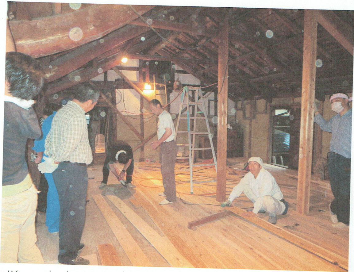
・ We need a lot of wood for making floor. とにかく大量の木材が必要でした。