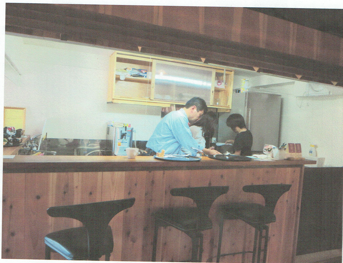
• This counter is made by carpenter.